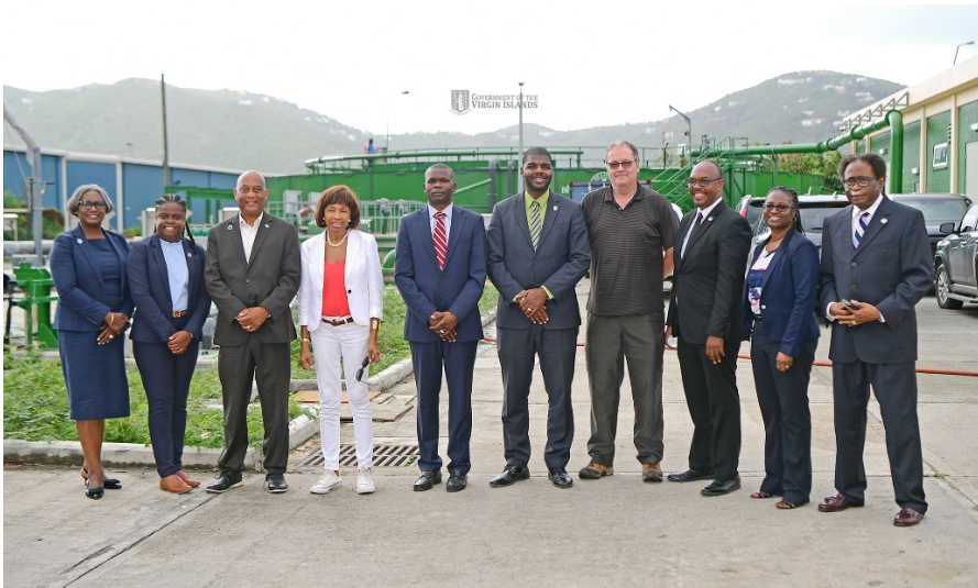
The Burt Point recommissioning ceremony was held on Friday, 12 April 2024