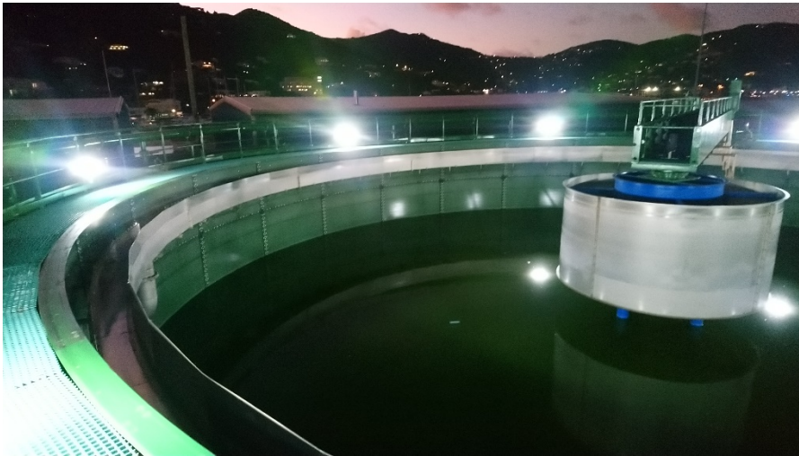
View of the enhancement of site lighting to the main Process Tank at Burt Point