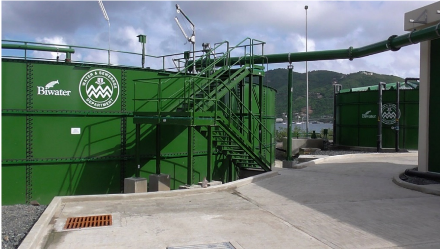
Burt Point package wastewater treatment plant, Bicom Model 3000N